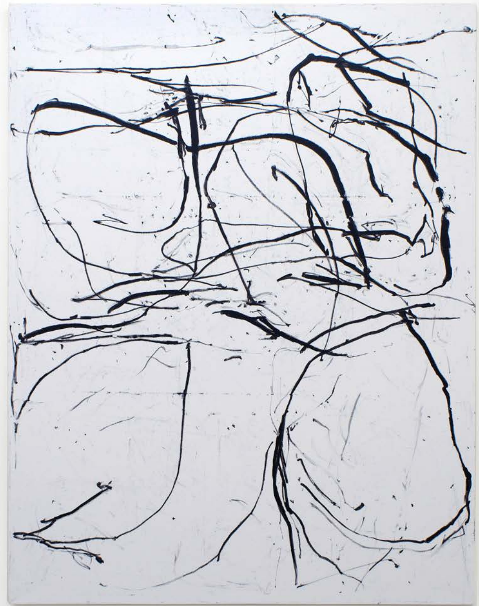
Op, 2021 Oil on canvas 72 x 56 [JH029]