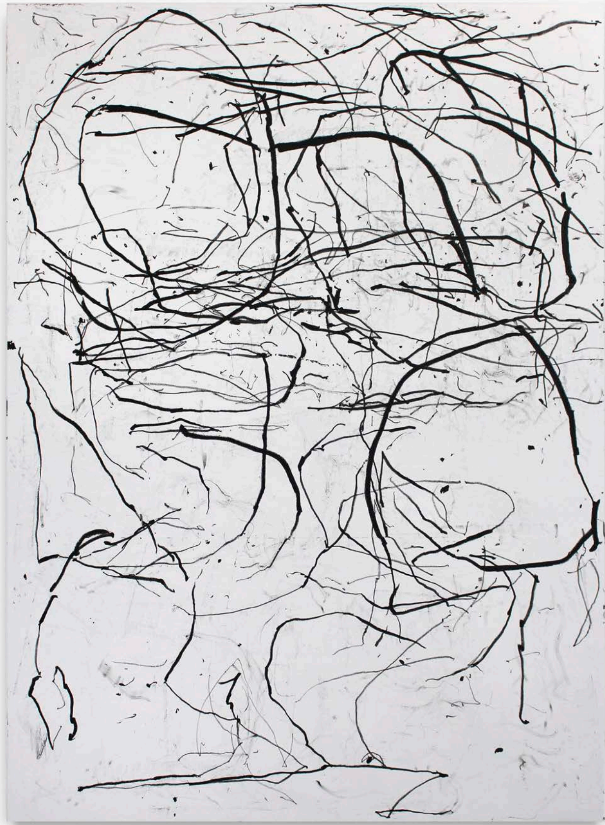
PBSS , 2021 Oil on canvas 72 x 52 [JHO30]