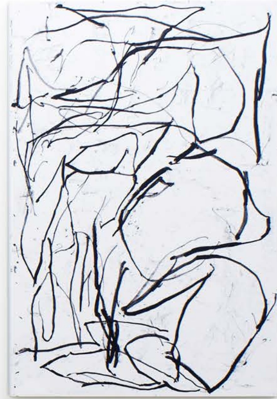
Nervous Systems Installation View