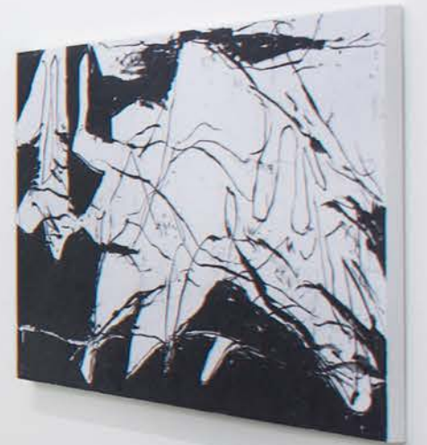
Nervous Systems Installation View