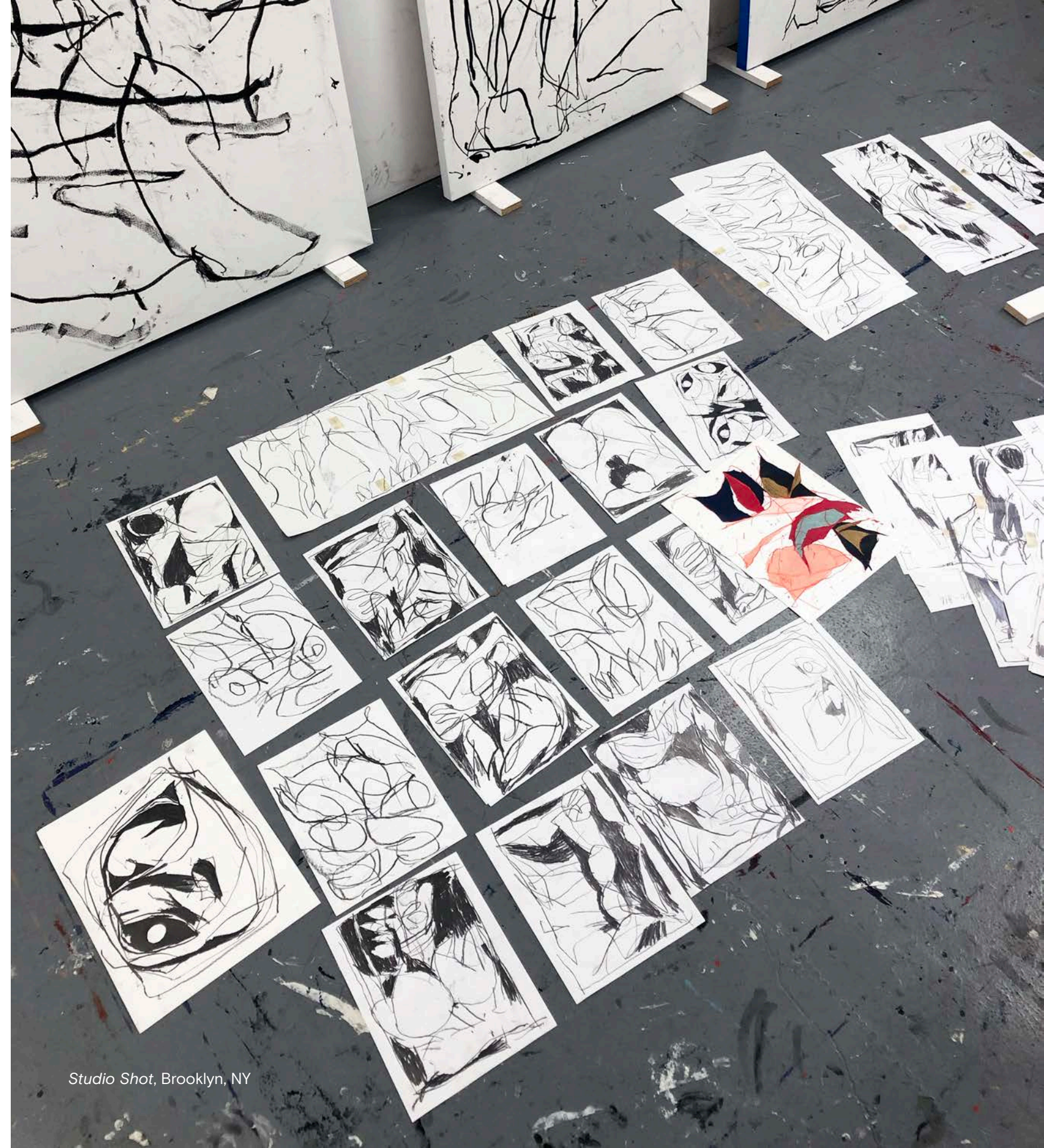
Studio Shot, Brooklyn, NY

Rhode Island School of Design Museum Davis Museum at Wellesley College The Metropolitan Museum of Art The San Francisco Museum of Modern Art