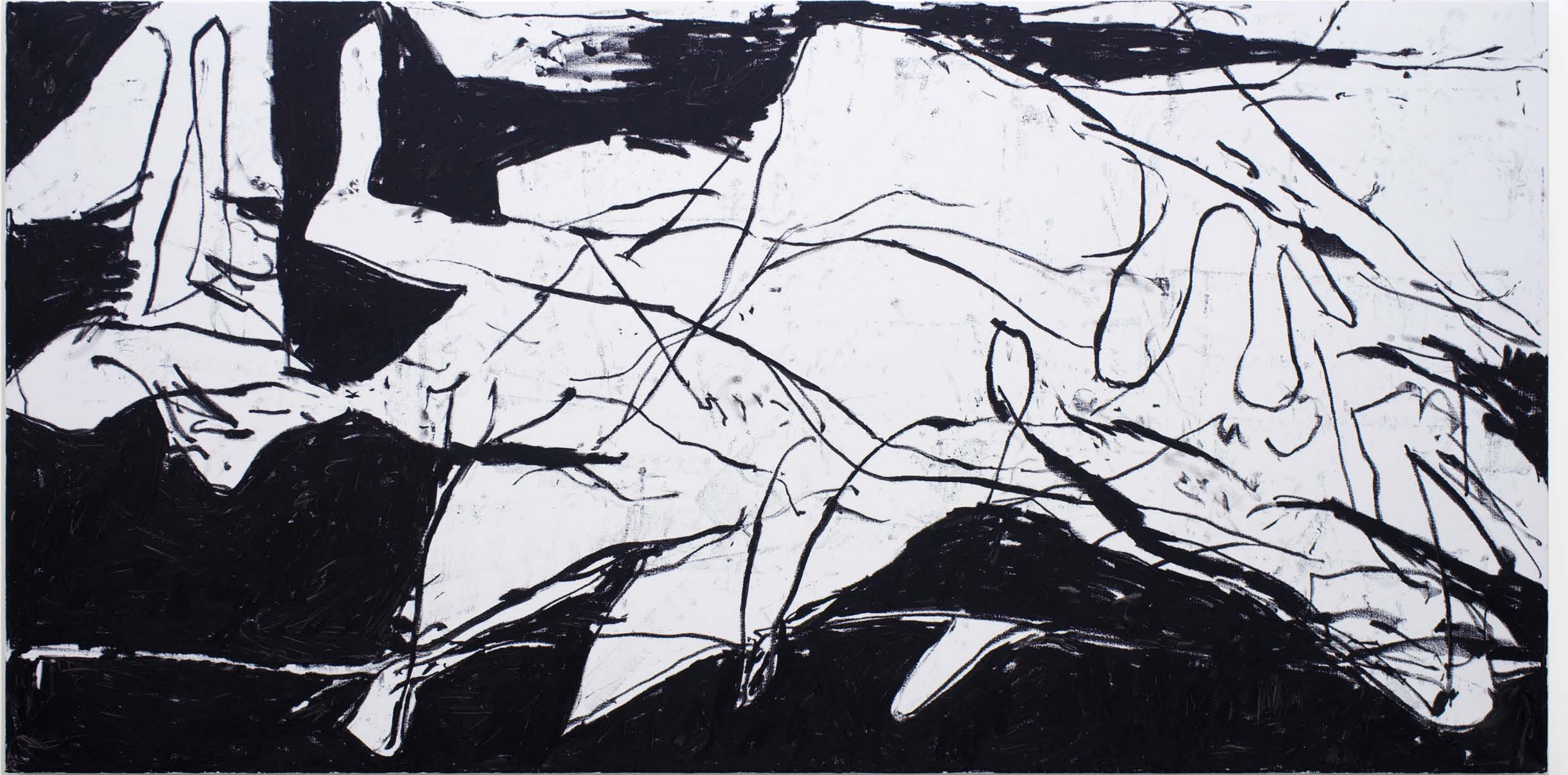
Torero, 2021, Oil on canvas, 30 x 60 [JHO32]