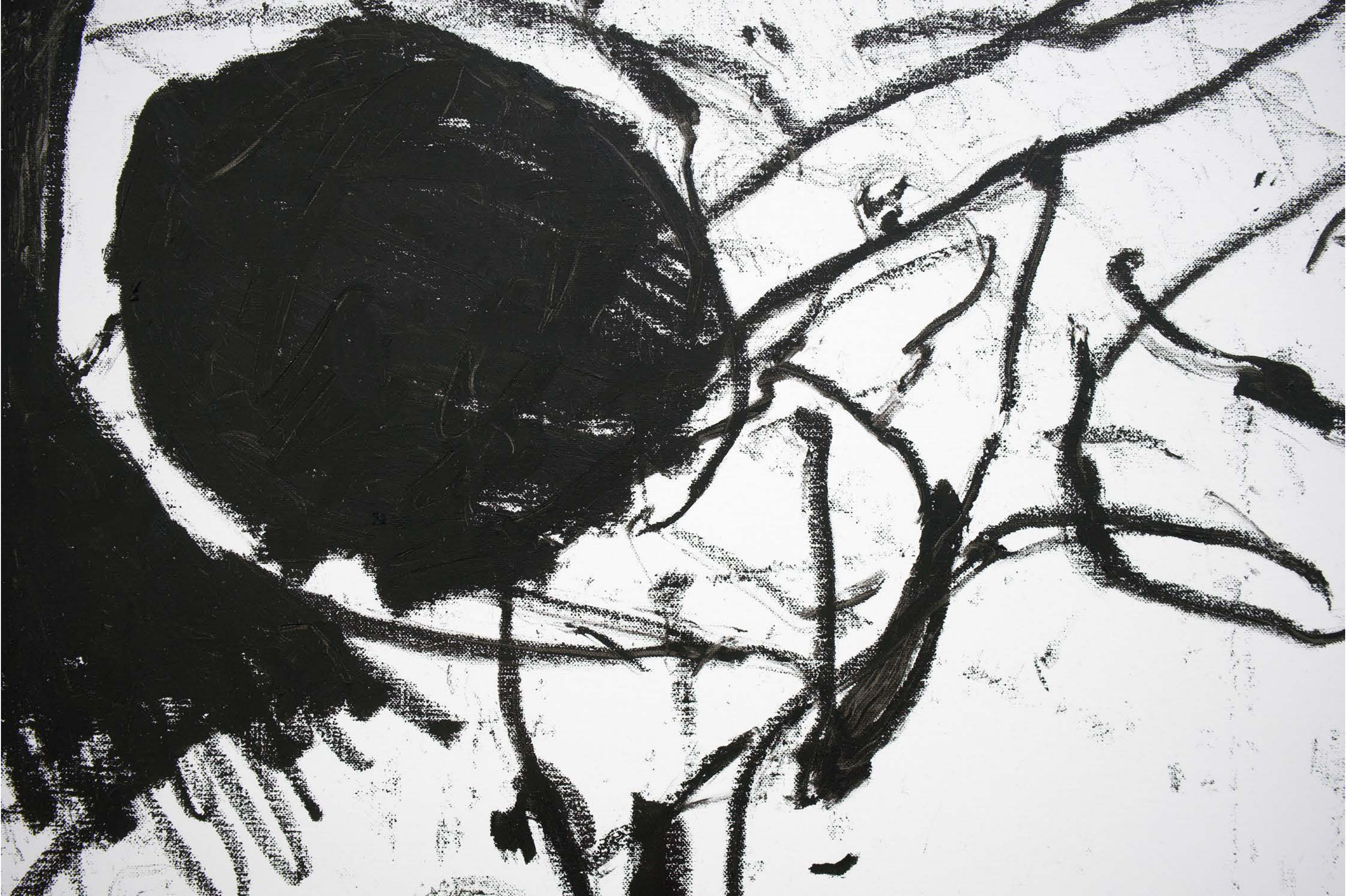
Session Musician (detail)