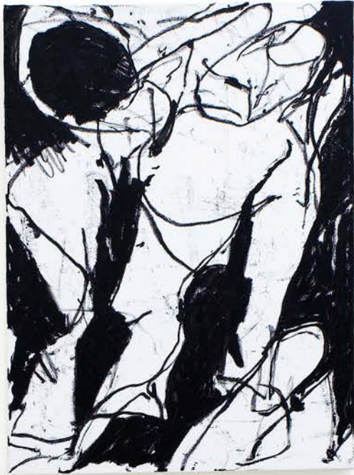
Session Musician , 2021 Oil on canvas 24 x 18 [JHO37]