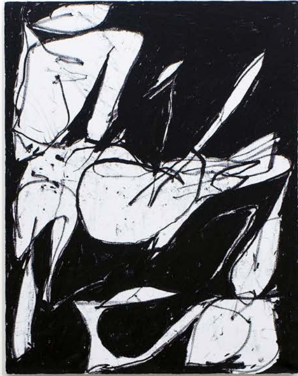
Comic, 2021 Oil on canvas 30 x 28 [JHO36]