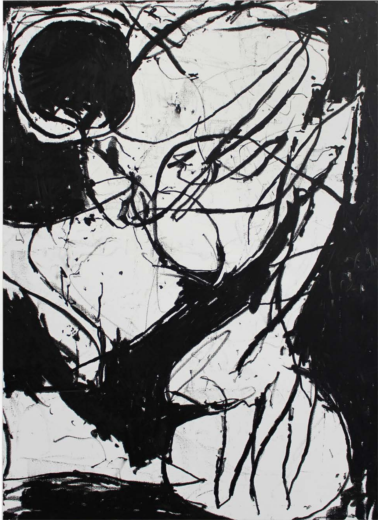
Palmed , 2021 Oil on canvas 40 x 30 [JH034]